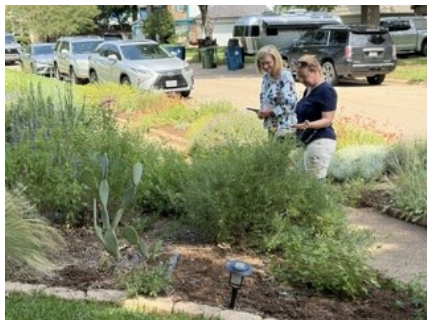
Above: Betsy Marsh's garden