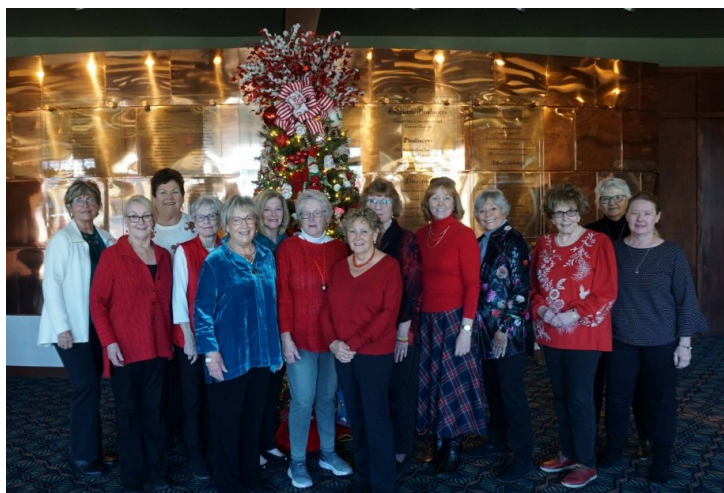
Holiday luncheon committee

Lovely tablescapes represented numerous countries and holiday traditions around the world