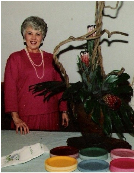
Arbor Day 1991