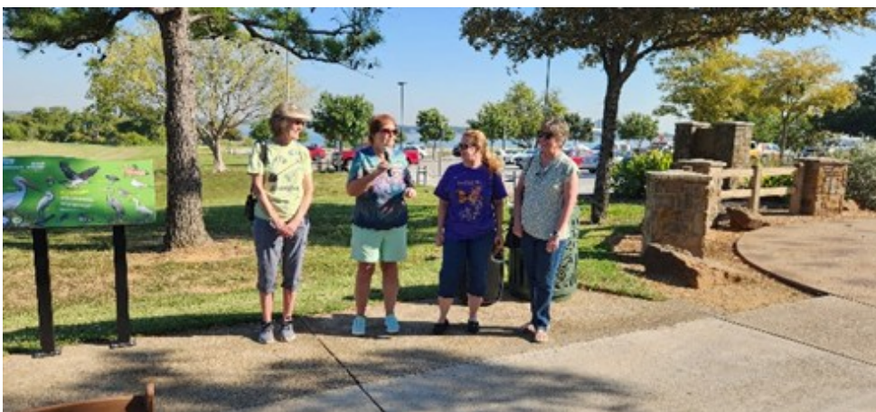
At left: GGC bird sign committee: