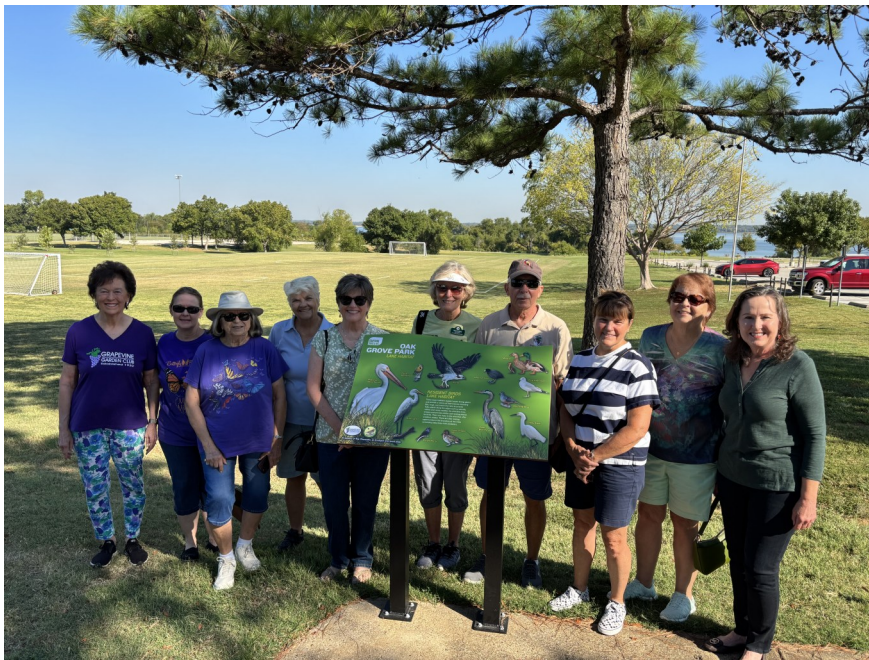
At left: Grapevine Garden Club members at the dedication of bird identification signage along Lake Grapevine on October 1, 2025.