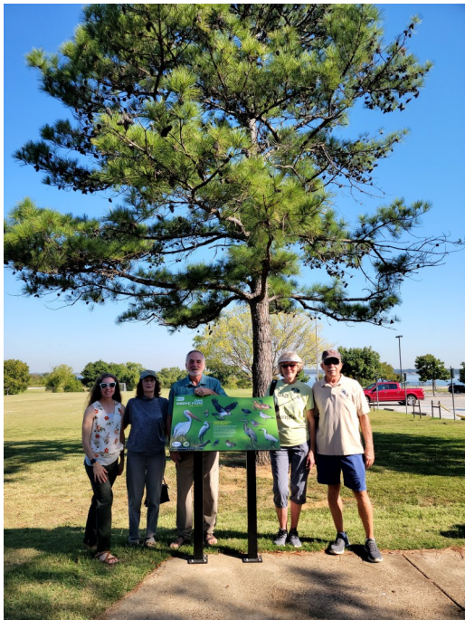
At left: Members of the Audubon Society of Fort Worth