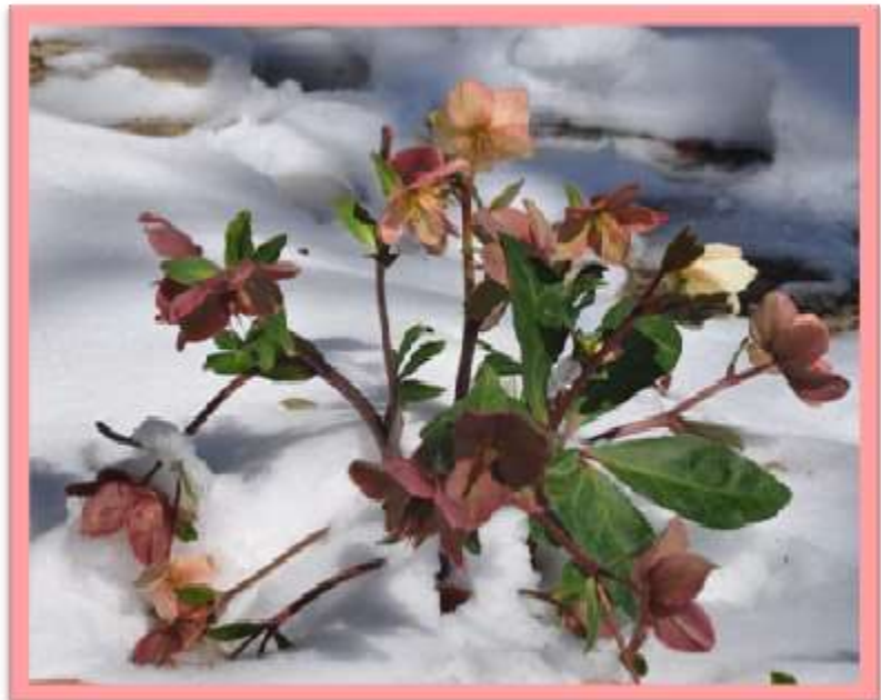
My Lenten Roses after our recent snowfall