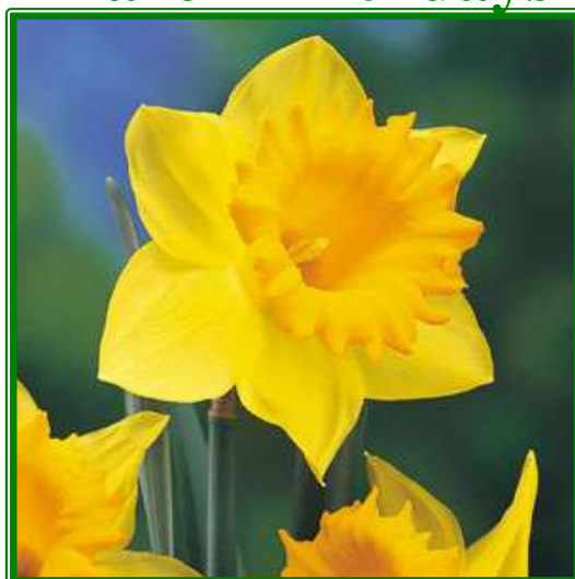
March Birth Flower, Daffodil