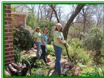
We Dig Plants!

There will also be a sign-up sheet at the January 24 th General Meeting for the "Digging Committee." We need volunteers to dig up and pot plants from our members' gardens for the Plant Sale. These are fun events -- you will be working side by side with friends in the garden for about an hour. If you are a new member, this is a great way to meet new people and learn about plants!