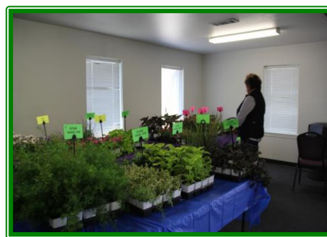
Workshop participants select from a wide variety of plants

If you have questions regarding any of these Workshops, please contact Karen Rice.