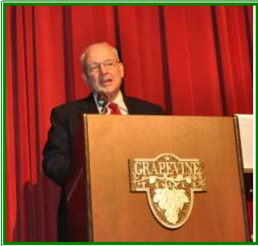
"Texas Home Landscaping: Planning and Plants"