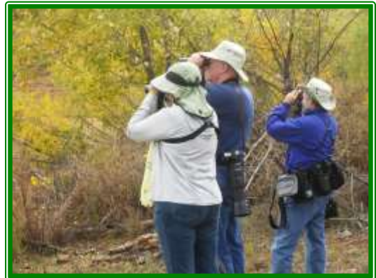
November 11, 2011