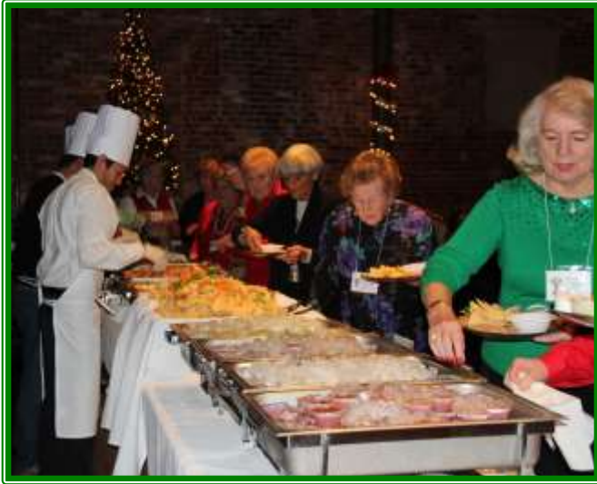
Catering by Esparza's