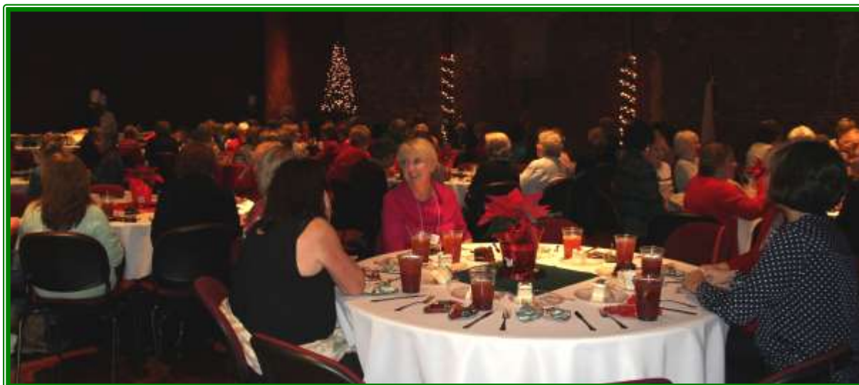
GGC Holiday Luncheon attended by 99 members and 16 guests