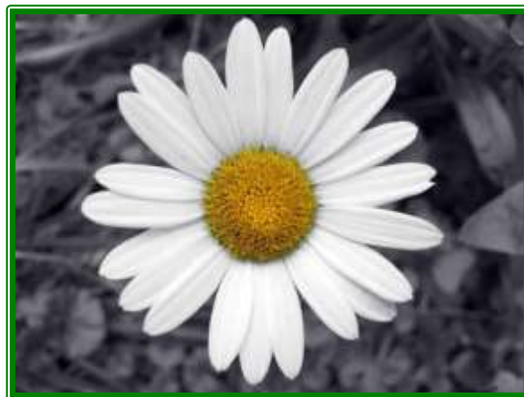
April Birth Flower, Daisy