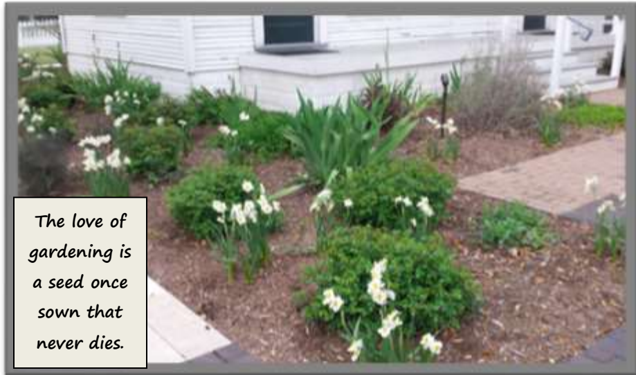
Daffodils planted at the Grapevine Historical Museum

will soon settle in. The sign up, Ways & Means and seed tables are now farther from the entrance but don't let that dissuade you from checking them out.