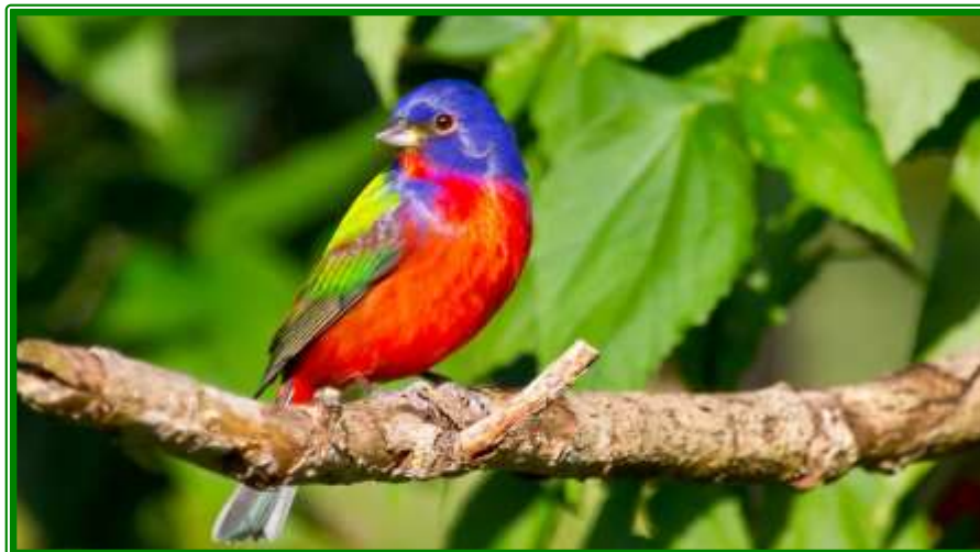
Male Painted Bunting