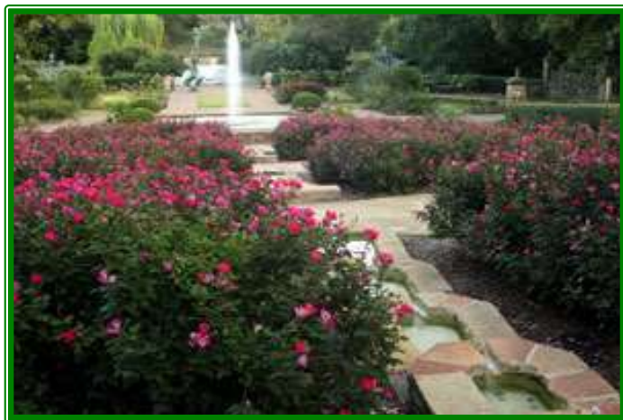
Rose Gardens, Fort Worth Botanical Gardens