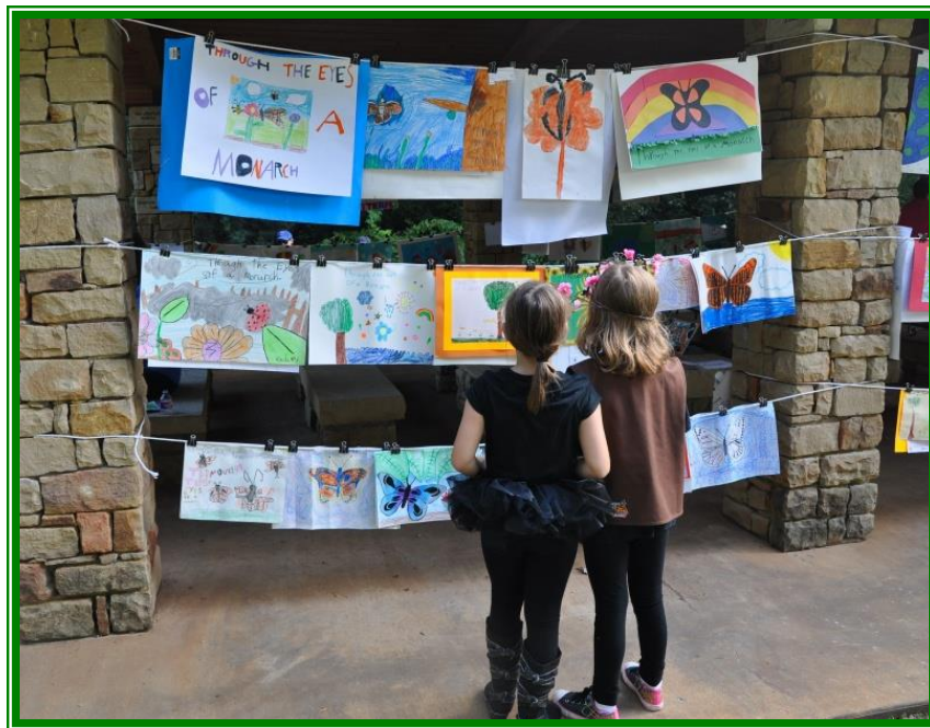
Butterfly Flutterby Art Contest 2016

☞ Terry Curcio Butterfly Flutterby Art Contest