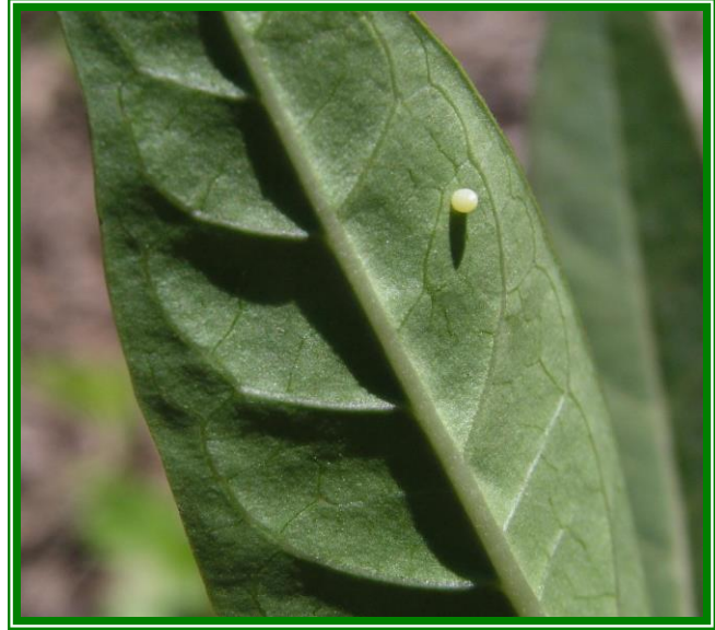
And so it begins: The Miracle of Metamorphosis

The volunteer time commitment for the event is minimal. As a committee, we will be responsible for delivering entry forms to the Grapevine Colleyville ISD elementary schools during the week of September 11 th and collecting the finished artwork on October 11 th . There will also be a few things to do on the day of the Butterfly Flutterby on October 14 th .