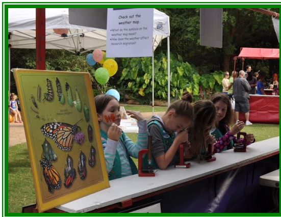
Science Center, Butterfly Flutterby 2015

It's going to be a long, hot summer but autumn has great things in store. The annual Butterfly Flutterby will be October 14, 2017, right after our first general meeting when we return from the summer hiatus. It will be the twentieth anniversary of this event! The theme of this coming year's Butterfly Flutterby is The Miracle of Metamorphosis . The Grapevine Garden Club works with the Grapevine Convention and Visitors Bureau to make this free event possible each year. We need your help. There are two volunteer shifts, 9:30 – 11:30 A.M. and 11:30 A.M. – 2:30 P.M. Many jobs require little or no standing or walking.