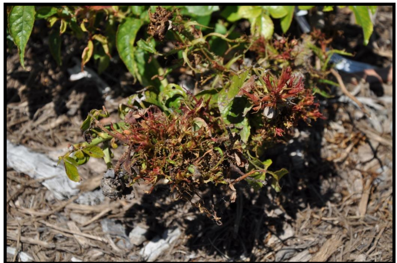
Rose Rosette Disease on Wedding Bells Notice the Witches' Broom growth pattern.