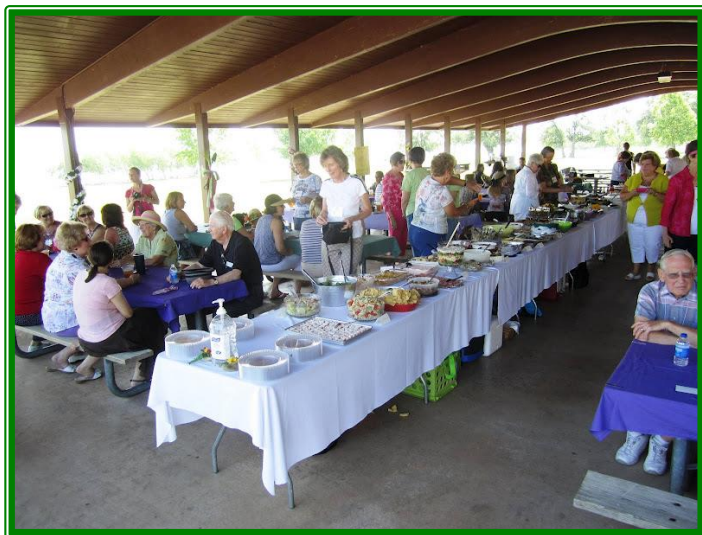
Spring Luncheon 2012