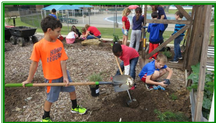
Grapevine Elementary Grade Two