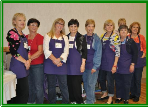
Hostesses April 2015

Please sign up at our spring luncheon to be a hostess for the September 2016 – April 2017 Grapevine Garden Club general meetings. As a hostess you will provide refreshments, put tablecloths on tables, welcome guests, and help with general cleanup following the meeting. Look for the bright green clipboard and sign up!