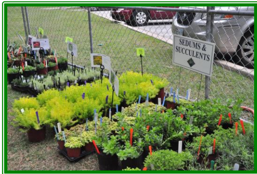
A Plethora of Plants to Choose From!