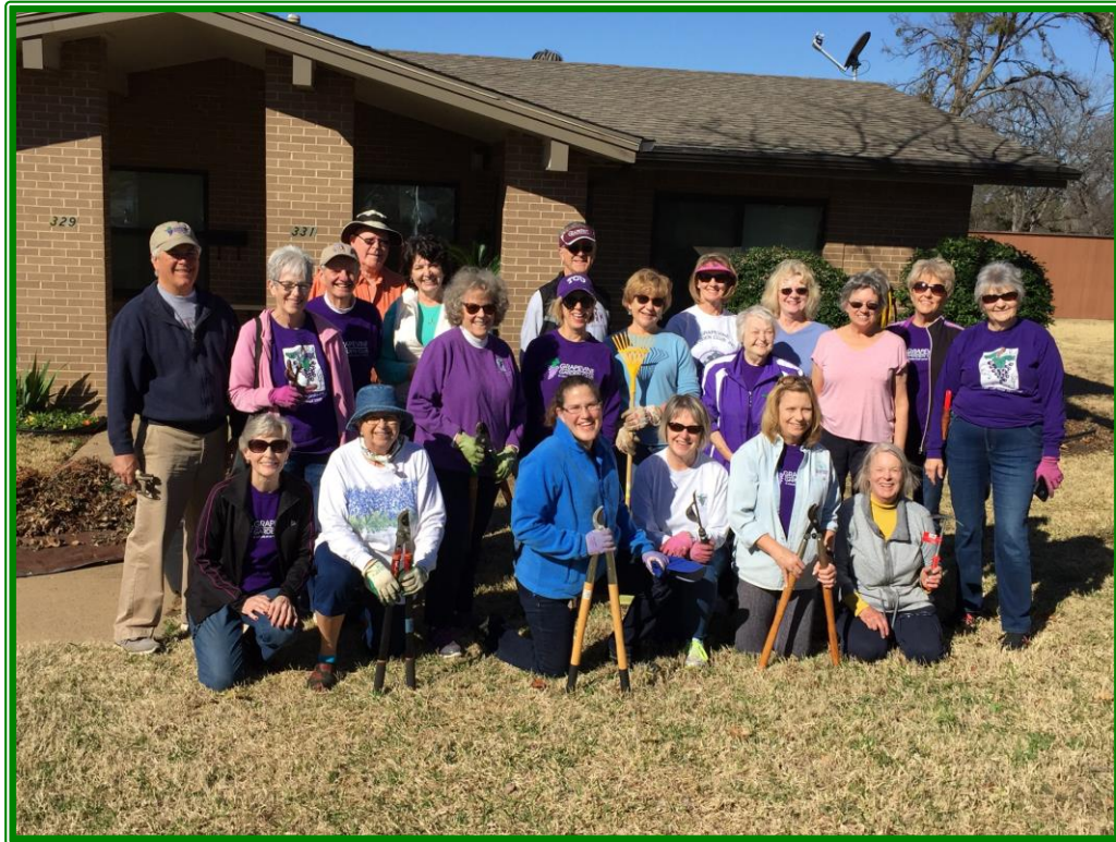
The West Texas Street Work Crew

As Valentine's Day dawned, the monsoons arrived and washed away our work day on West Texas Street, so we all rolled over and went back to sleep! We certainly need the rain and didn't want to scare it away, so we postponed our work day. WOW!!! What a difference a week makes!!!