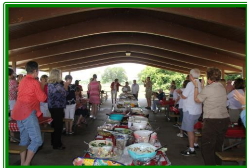
2016 Awards Presentation