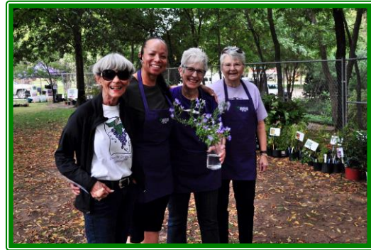
Along with Expert Assistance!