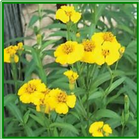
Mexican Mint Marigold

There is still time to schedule a Digging Party in your garden if you have any of the following plants to donate: