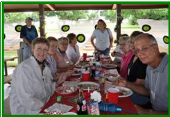
Having Fun at Last Year's Luncheon