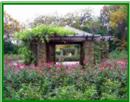
Oval Rose Garden

From the frothy waterfall framed with sparkling floral color to the soothing brook laden with ferns, the tour with Cindy Woelke of the Perennial Garden has something for everyone. Chefs will appreciate the culinary herb collection and photographers will be delighted by its beauty.