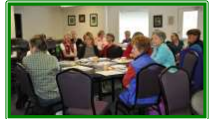
Docents in the Bessie Mitchell House