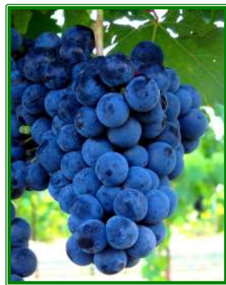
Eden Hill Winery Tempranillo Grape