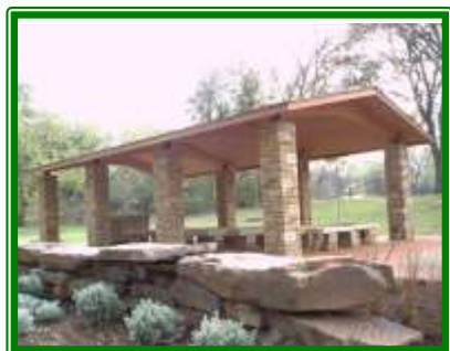
Education Pavilion Grapevine Botanical Gardens

The GGC 2014 spring plant sale is Saturday April 26 th at the Grapevine Botanical Gardens. Sale hours are 8:00 A.M. to 1:00 P.M. Free seminars will be offered at the Education Pavilion near the plant sale area. You will not want to miss these informative sessions!