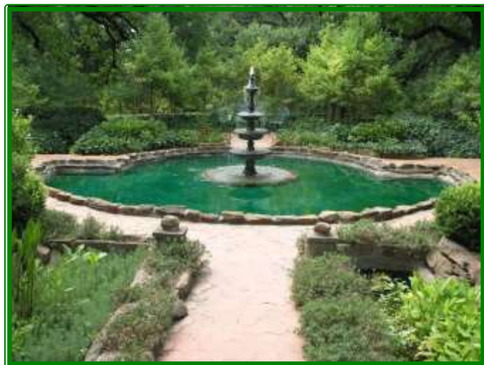
Chandor Gardens, Weatherford, TX