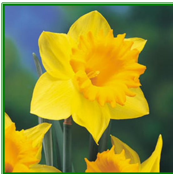
March's Birth Flower daffodil