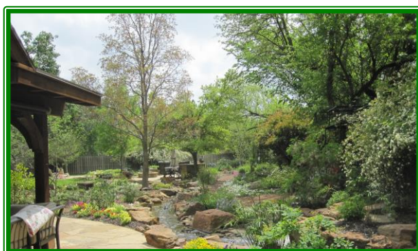
The Stone Garden