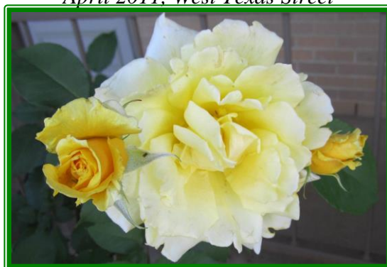
April 2011, West Texas Street

I will have a sign-up sheet at the March meeting, but don't hesitate to call or e-mail me if you can participate that day. The carrot for the day will be coffee or tea at Main Street Bakery after all the work is done. It is a good time to swap lies and talk about our aches and pains, so come and play with us and enjoy some good times.