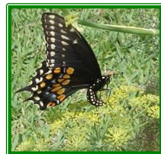
black swallowtail on dill

Our Greenhouse Project team continues to seek new sources of funds for donations to the project. There is now a pledge form available on our GGC website. We would like to get 100% of our club in the "given" column. We know the completed greenhouse will benefit GGC and the community in many ways which support the GGC mission of promoting interest in horticulture, conservation, and in education and service to the community. We thank you for supporting this project.