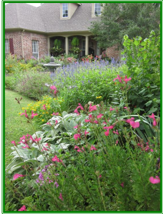
"Henry Duelberg" Salvia, Rudbeckia 'Goldsturm', Phlox paniculata, pink salvia greggii, cosmos, holy basil, shasta daisies