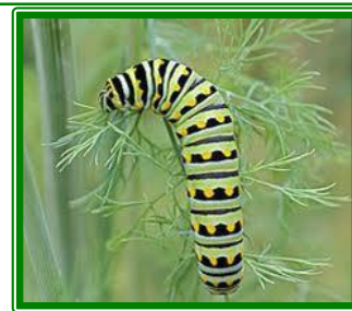
black swallowtail caterpillar

I recently read an article in the Texas Gardener titled "Why I Grow Dill." It was about planting enough dill to share with the caterpillars as well as having enough fresh dill to season a meal or two. That theme could be used for why we all garden. We love the resulting beauty our flowers and landscapes give us and the good tasting food we might grow. However, a greater pleasure is sharing our plants and knowledge with others. One excellent sharing opportunity is to offer divisions of your favorite plants as we prepare for the annual spring plant sale. The sale makes wonderful plants available for reasonable prices, and the resulting proceeds fund our scholarship and civic programs.