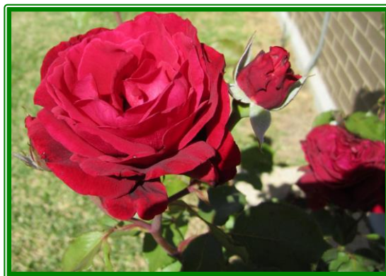
April 2011, West Texas Street

It is time for some foolishness and a little messing around in the dirt. I certainly hope 9:00 A.M. is not too early for most of you, but there will be lots to do that day. We will be weeding, of course, and clipping back a few things that need attention, and then we get to do the fun part and plant the summer color. Generally speaking everything looks wonderful. But because we have not spread much mulch these last few years, the beds look sort of bare in the mulch department. So we will need lots of hands that day to get the job done. Be sure to bring the necessary tools and dress for whatever the weather will be.