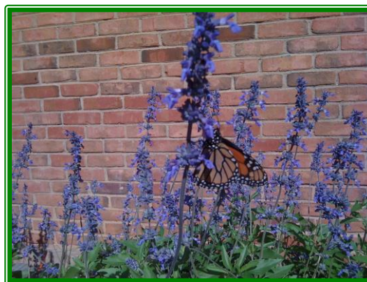
"Henry Duelberg" Salvia