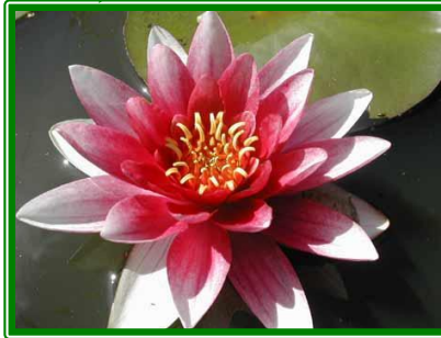
July Birth Flower water lily