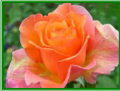
June Birth Flower rose