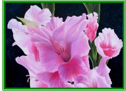
August Birth Flower gladiolas