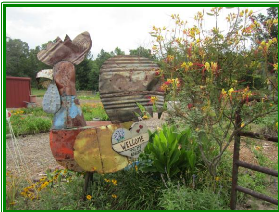
Big Chicken Daylily Farm

National Garden Week was celebrated with a tour to East Texas to study the cultural requirements of daylilies at the Big Chicken Daylily Farm in Brownsboro and to purchase daylilies from the approximately 800 cultivars available for sale. Our time with daylily expert, Dawn Volynn, was followed by lunch at The Shed in Edom. The amazing demonstration gardens at Blue Moon Gardens in Chandler stimulated the purchase of perennials, shrubs and herbs after attending a class on harvesting and preserving herbs.