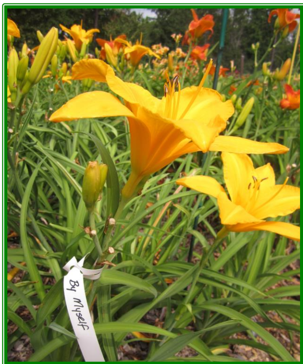
Big Chicken Daylily Farm