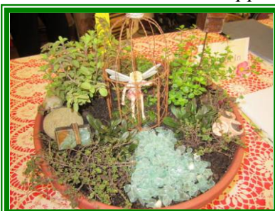
Fairy Garden door prize from Tim's Landscape Garden Center