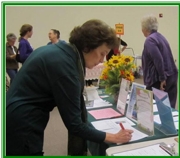
Opportunities to get involved