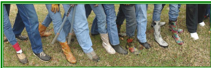
These boots are made for WORKIN'! And that's just what they did!

We really had a great work day at the low-income housing project on West Texas Street. We pruned, weeded, and visited with the residents and each other. What a beautiful day it turned out to be.... cool, sunny, not too hot, not too cold, just right.