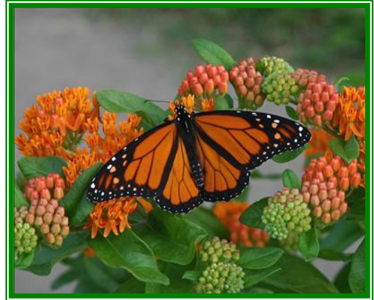
Monarch Butterfly on Butterfly Weed Asclepias tuberosa

The Monarchs are coming!! The Monarchs are coming!! It's time to get your Monarch Way Station fired up. Last summer's drought and the continuing West Texas drought, has taken a huge toll on wildflower production across the state of Texas! As gardeners, we can provide way stations for migrating Monarchs enabling them to survive their trek north. Our gardens should have nectar plants for nourishment, as well as larval plants specific to the Monarch's needs.