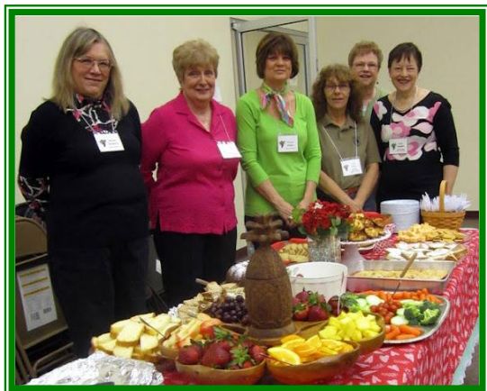
Hostesses February 28 th :

Mail your check for $30 single membership or $35 for family membership to Grapevine Garden Club, PO Box 811, Grapevine, Texas 76099. If you are mailing your renewal dues to the post office box and want a free one-year subscription card, please include a self-addressed stamped envelope. Or bring your check to the general meeting on March 27. Don't miss out! Rejoin this month and continue the fun.