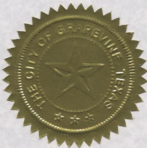
Mayor, City of Grapevine

This award recognizes the club's outstanding projects and involvement in the community. We are all proud of our Grapevine Garden Club for what they do, with the realization that all citizens enjoy and appreciate these beautification projects and continue to support the endeavors of this worthy club.