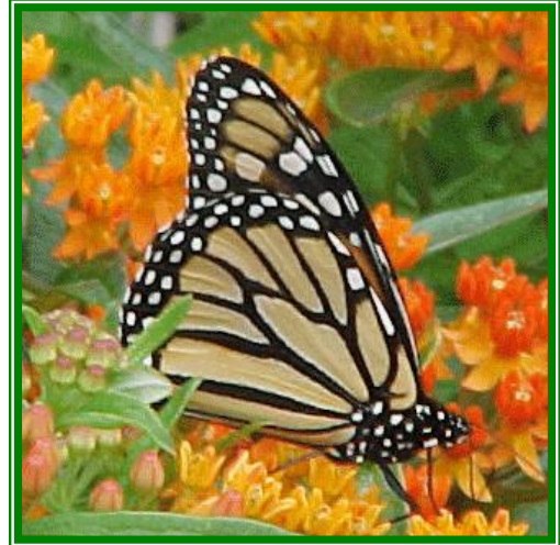
Monarch Butterfly on Butterfly Weed Asclepias tuberosa

This story about the monarchs in Mexico is troubling. We can't fight the big farming corporations with their genetically-altered corn and soybeans, but we can encourage gardeners in Texas to plant milkweed and prepare butterfly gardens. Information below is from the Monarch Watch organization at the University of Kansas in Lawrence, Kansas.