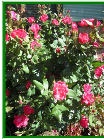
Roses on West Texas Street