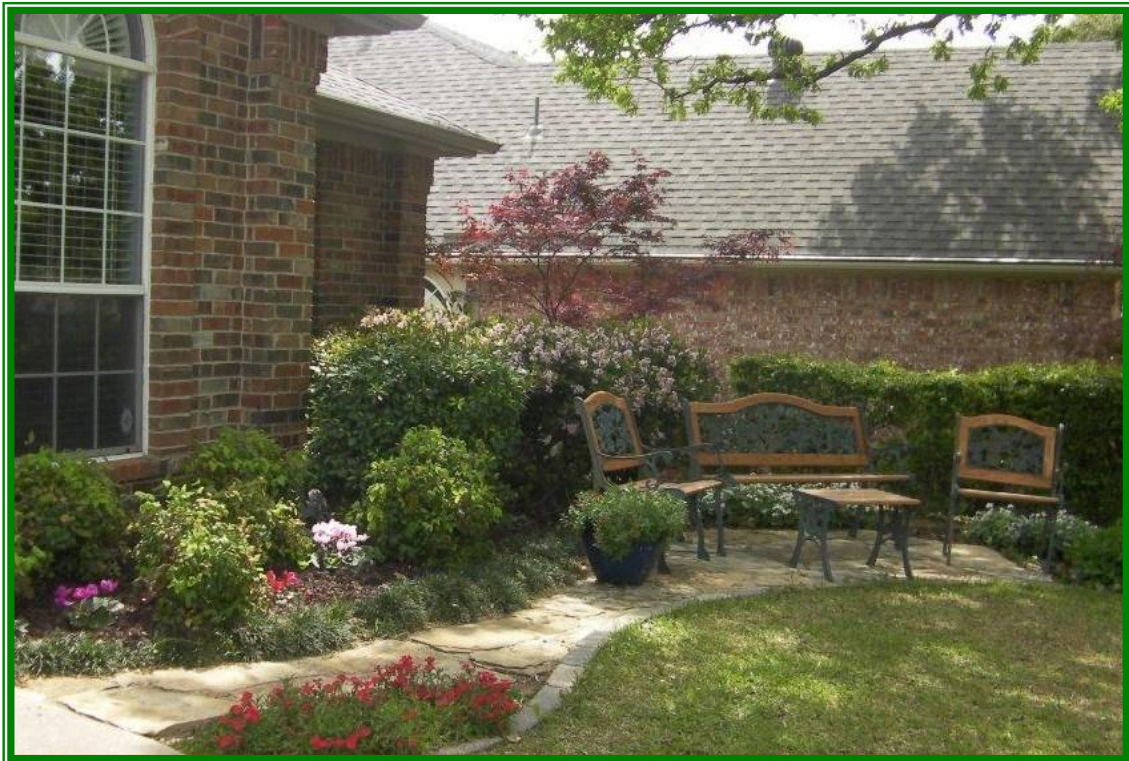
Nancy Nivens' front garden