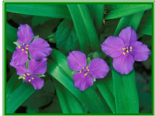
Spiderworts Tradescantia ohimensis