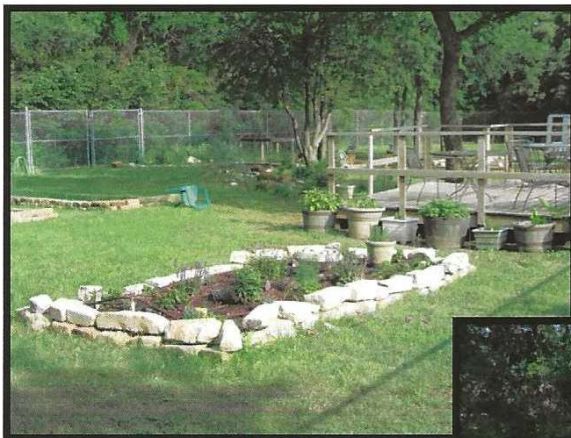
Butterfly Garden Timberline Elementary Grapevine, Texas