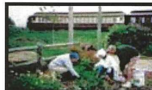
2001 Heritage Garden