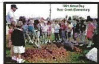
1991 Arbor Day at Bear Creek Elementary

Considering the benefits of gardening, it only makes sense for the NGC to declare a National Garden Week, June 5-11. GGC members will celebrate the event by attending a guided tour at the Botanic Research Institute of Texas. BRIT's new $48M building opened on May 21 and will dramatically raise the non-profit's profile. BRIT holds more than a million dried plants in its herbarium, conducts botanical conservation and research worldwide, and works to educate young people about plant diversity.