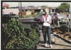
1988 Main & NW Hwy Landscape Project

The NGC, a not-for-profit educational organization with its headquarters in St. Louis, Missouri, is recognized as the largest volunteer gardening organization in the world. It is composed of fifty State Garden Clubs and the National Capital Area, 6,218 member garden clubs, and 198,595 members.