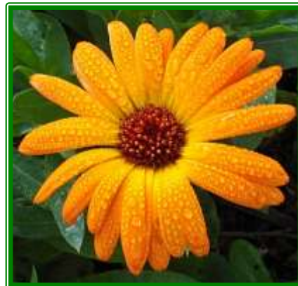
October Birthday Flower calendula