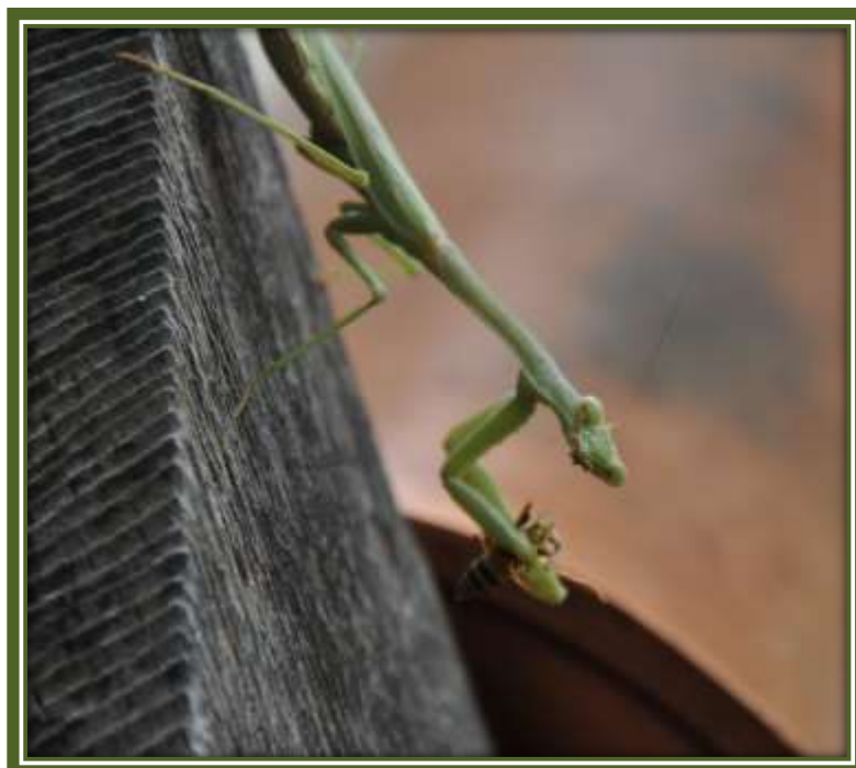
One of Pam's gardening helpers hanging out on the mailbox