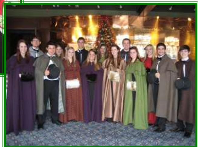
Grapevine High School Jazz Choir 2011