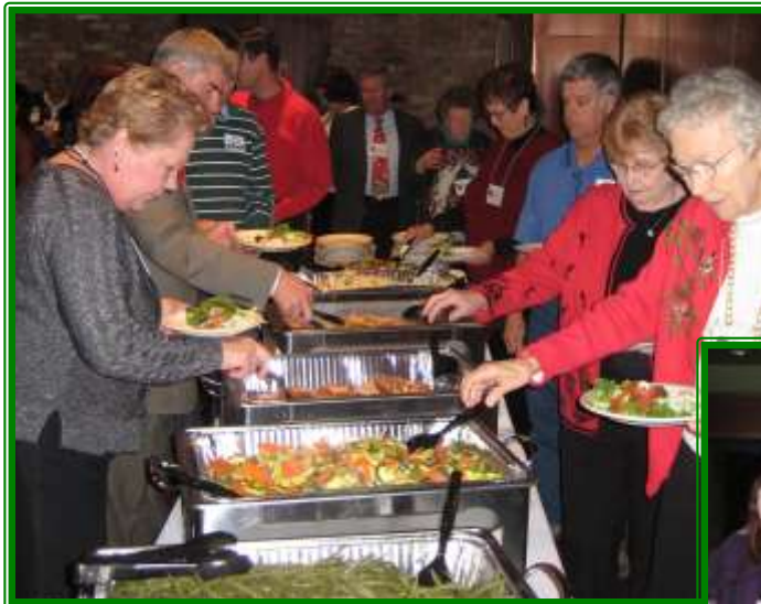
GGC Holiday Luncheon 2011